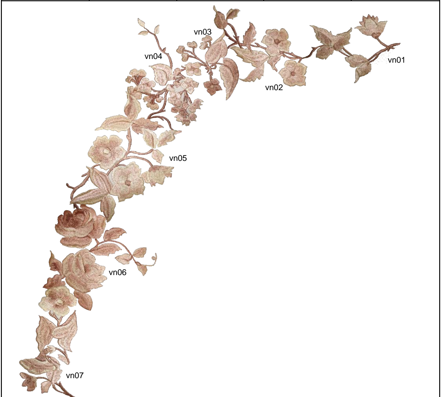
Combination Design: vn01, vn02, vn03, vn04, vn05, vn06 and vn07.